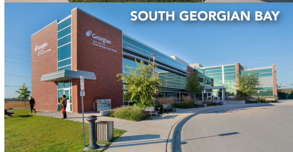
SOUTH GEORGIAN BAY